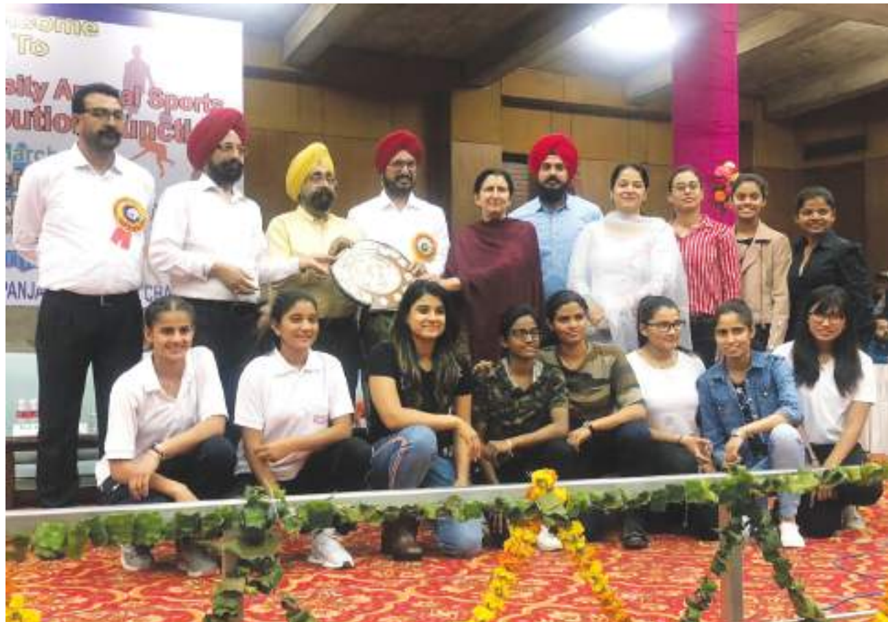
Guru Gobind Singh College for Women won the Runners Up Trophy in Panjab University overall Sports Championship 2018-19 bagging Eleven Championships in various games.

Keeping the tradition of marvelous achievements, the College stood first in Boxing, Volleyball, Hockey, Rugby, Cricket, Kho-Kho, Soft-Ball, Rowing, Kayaking, Netball and Basketball, Athletics, Swimming, and Pencak Silat in Panjab University Inter-College Tournaments.