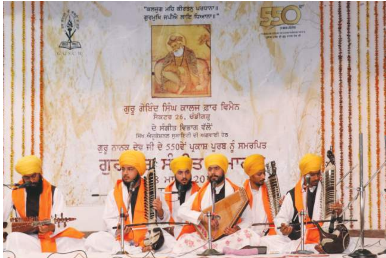
Team members of Jawadi Taksal performing at Gurmat Sangeet Samagam