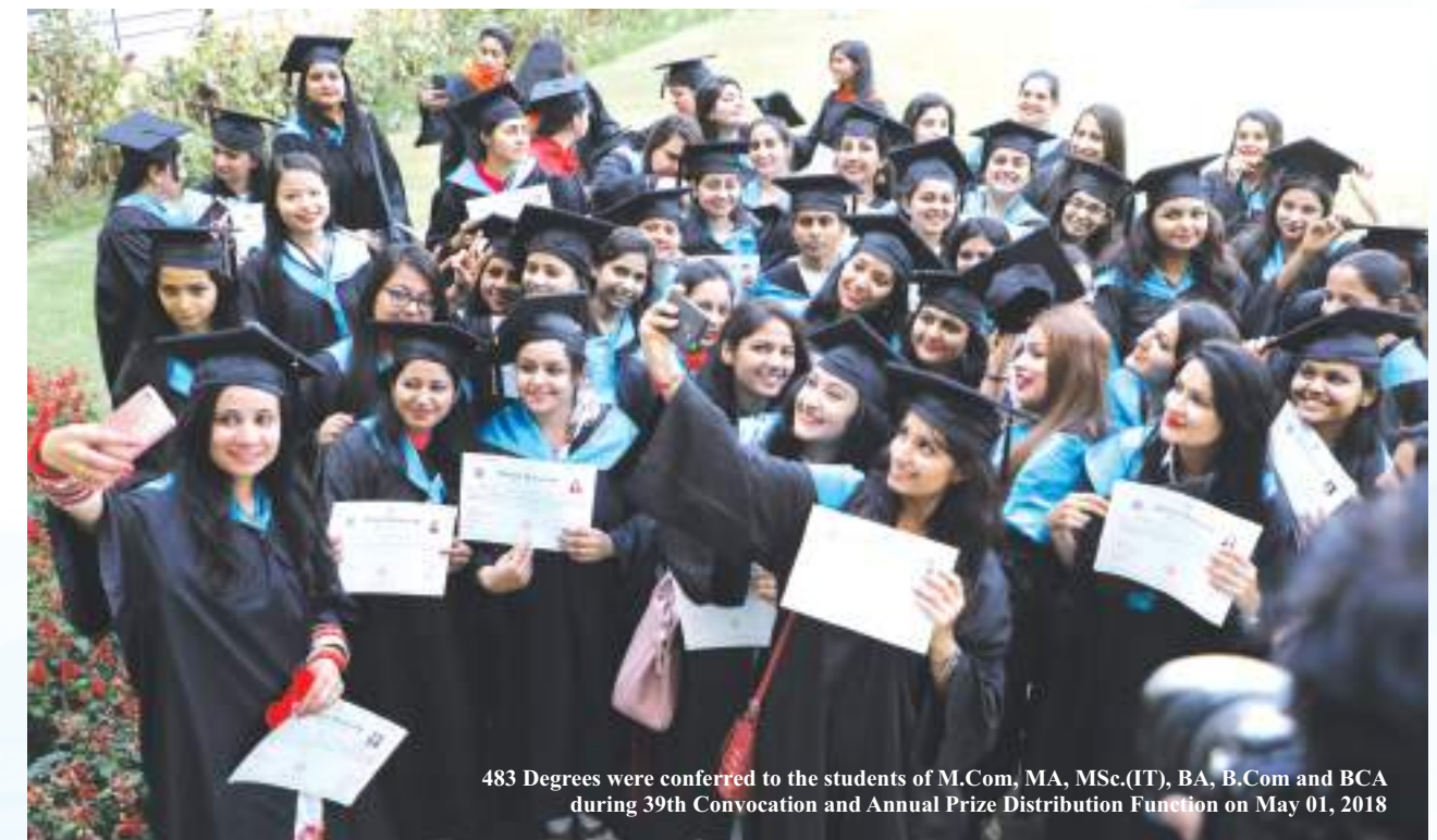
483 Degrees were conferred to the students of M.Com, MA, MSc.(IT), BA, B.Com and BCA during 39th Convocation and Annual Prize Distribution Function on May 01, 2018

Finally, I would like to thank my dear students for the active contribution in all the College activities and their achievements. I wish you success in all future endeavors.