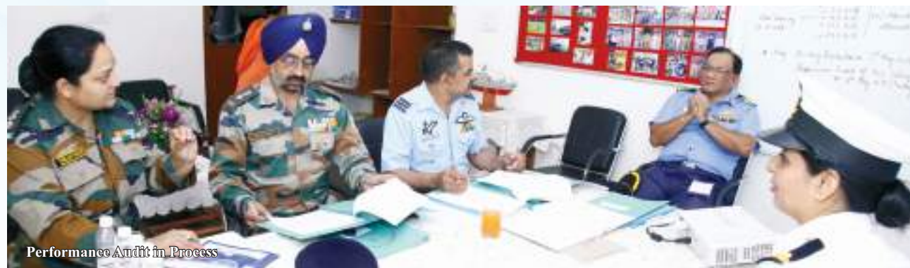
Performance Audit in Process