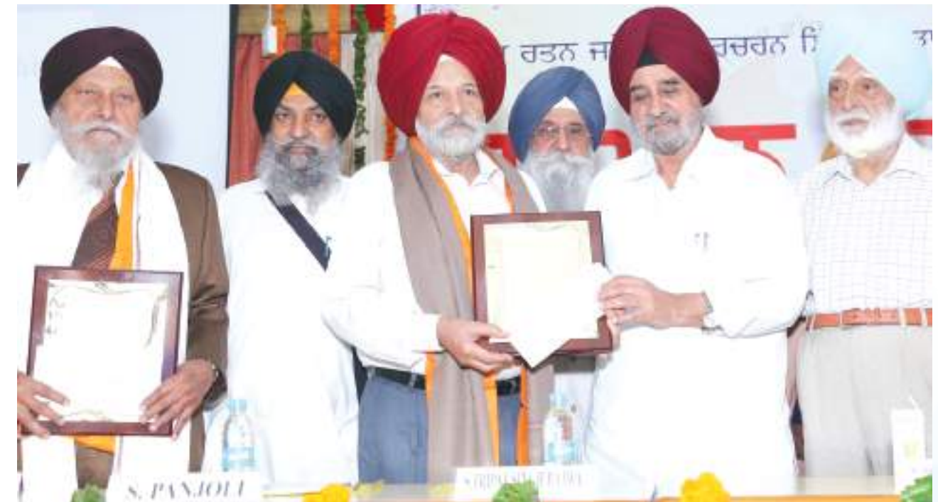
Sardar Tript Rajinder Singh Bajwa, Jathedar Gurcharan Singh Tohra Awardees, distinguished guests with esteemed Members of Sikh Educational Society